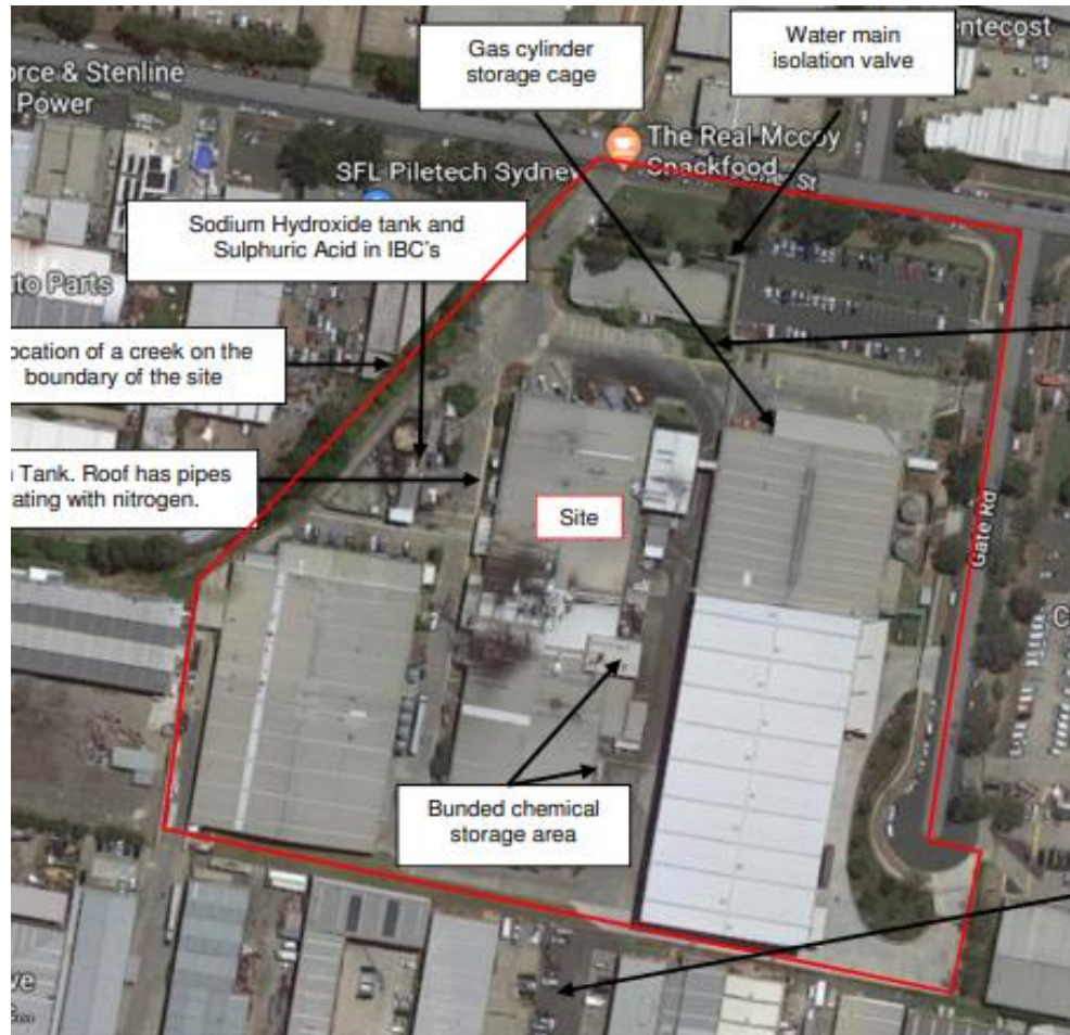
Figure 1. Street Directory Map

Premise related to License no. 21243 is the area occupied by Lot 1 DP 205360 as shown below